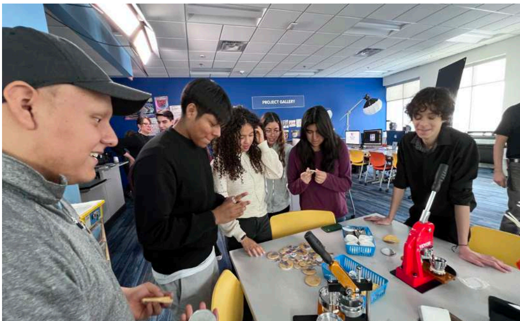
Engaging Latino youth in the Best Buy Teen Tech Center @ CLUES

Asset building is key to building prosperity and advancing financial equity for Latinos. We believe in improving economic conditions that foster wealth-building, Latino ownership, and asset creation that advances socioeconomic mobility for Latinos, including housing, community centers, cultural enterprises, and businesses.