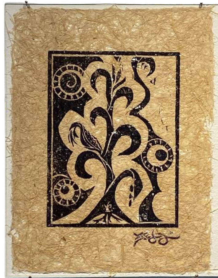
Zamara Cuyún, "Ch'atam Ulew", woodcut on corn husk paper, 12" x 9", 2024